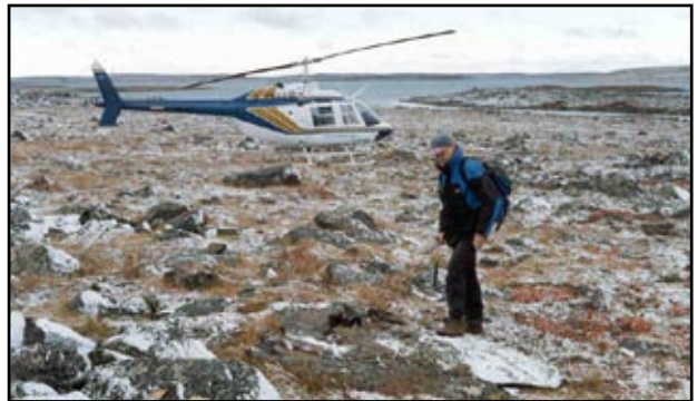
Surface sampling leads to newly discovered gold and silver zone at Greyhound Project in Nunavut, Canada.

Data acquired in late 2010 from surface and soil sampling surveys, in combination with earlier airborne MEGATEM geophysical survey results, has delineated a possible source for the high grade copper-zinc float samples grading 9.2% copper and 18.5% zinc found 850 meters northeast of Aura Lake on its Greyhound