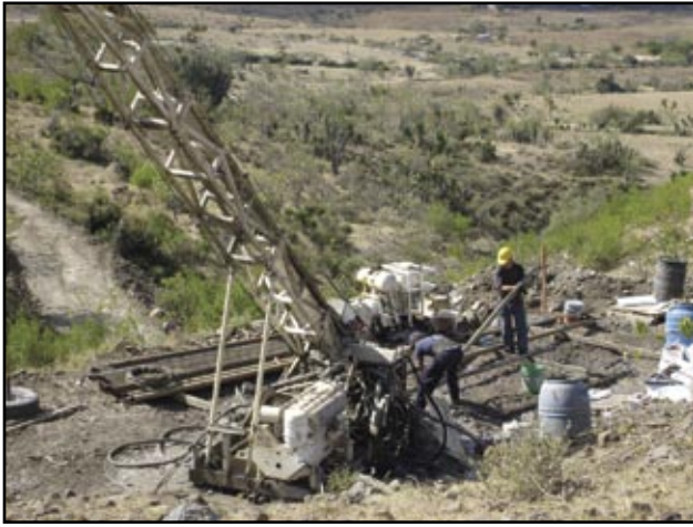
Drill operating at Taviche Project in Mexico. Aura Silver's 2011 drill campaign at its Taviche Project in Mexico is focusing on large targets characterized by broad, high grade silver intervals as high as 3,932 g/t silver equivalent and will test for deeper gold.

40 kilometers north of the community of Baker Lake and south of Agnico-Eagle's Meadowbank mine. Although the property is situated in the high Arctic, the local infrastructure is excellent. An all-weather road from Baker Lake to the Meadowbank mine crosses through our Greyhound property, within one kilometer of Aura Silver's gold/silver zone discovery.