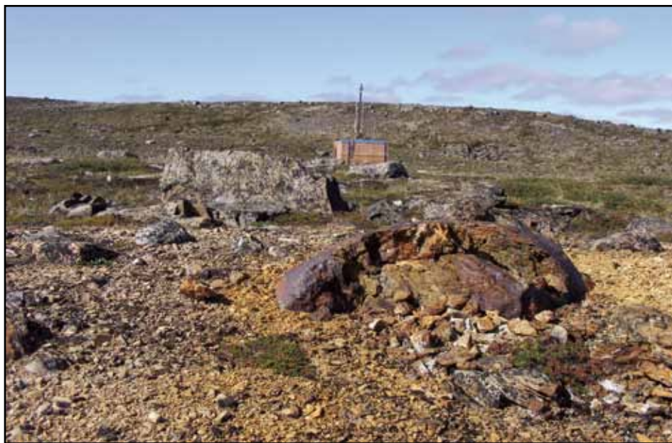
Aura Silver drills under sulphide-enriched banded iron formation in search for gold at Greyhound Project in Nunavut, Canada

iron formation. The prospect is subdivided into 4 areas. The first target has an exposure of sulphide-bearing iron formation with a grab sample that assays 3.85 g/t Au. In addition, there are gold anomalies in soils up to a remarkable 2,000 ppb Au (2 g/t Au) along a line running east from the mineralized subcrop for at least 300 meters. This target will be tested by a fence of holes aggregating up to 400 meters of core. The second and third portions of JohnPaul is a target 200 meters south and is defined by one line of an HLEM anomaly which continues south through the lake and onto the south shore. Highly geochemically anomalous soil values have been traced southerly from this point for 800 meters. The fourth